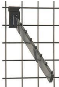
7-BALL WATERFALL HOOK