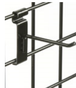
GRID WALL HOOK