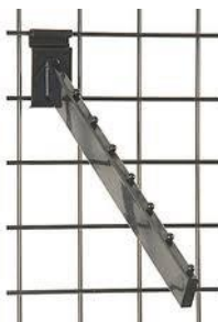
7-BALL WATERFALL HOOK