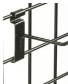
GRID WALL HOOK